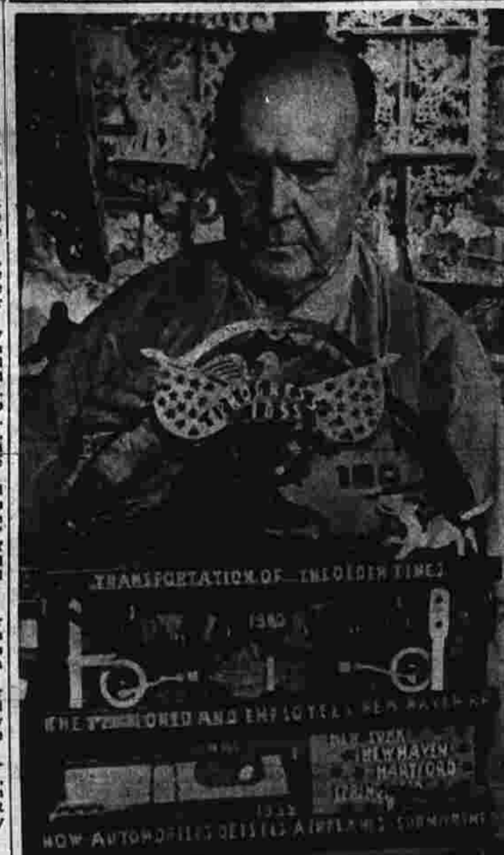
Otis Kingsley Herald Photo.